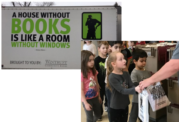
Bernie's Book Bank Returns! R.C. Students Receive Books to Enjoy. Thank You!!!