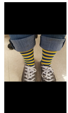
Ridge Central's Early Childhood Students and Teachers Embrace a Day of Uniqueness!