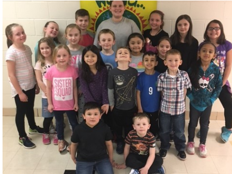
Ridge Central's March Students of the Month.