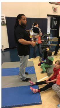
PTA Family Read Night