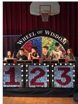
Character Counts! Plus Activity Wheel of Wisdom