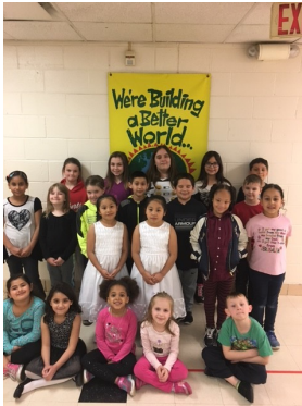
Ridge Central's April Students of the Month.