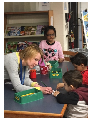
EL Family Night