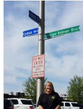
Principal Bollinger Boulevard Dedication Thank You!!!